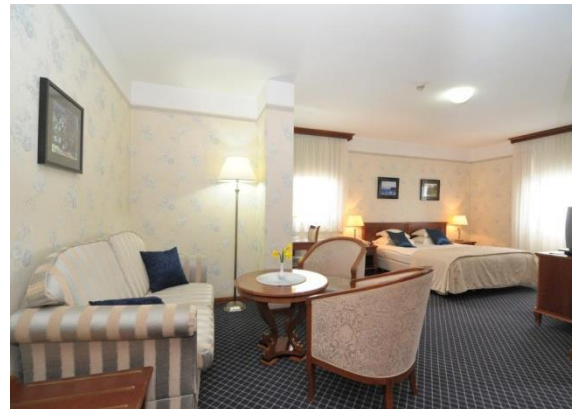
SUPERIOR ROOM 85 €