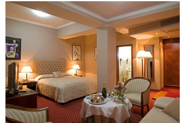
DELUXE ROOM 95 €